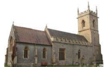
Hinton on the Green